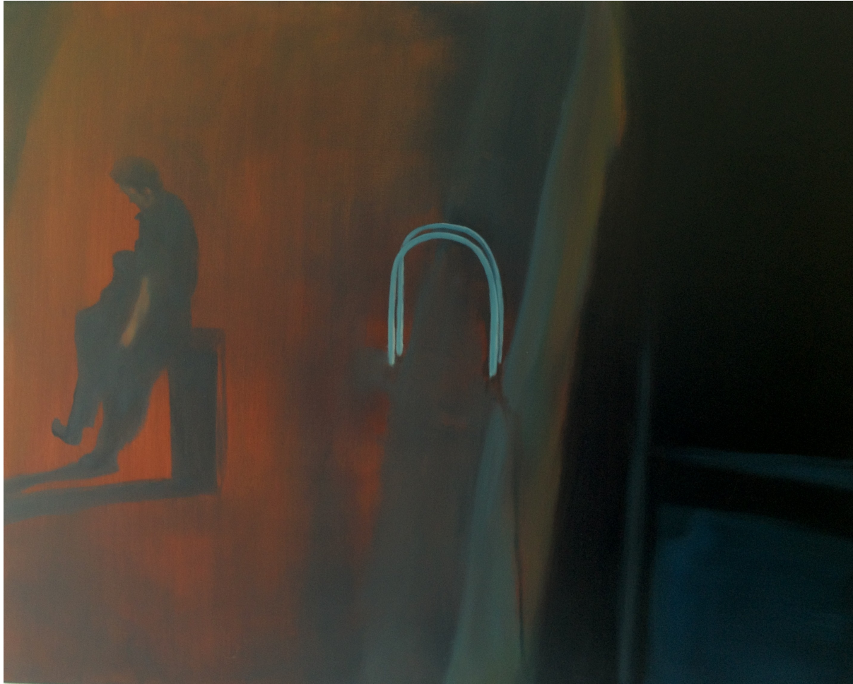
'Lean post' Oil Painting