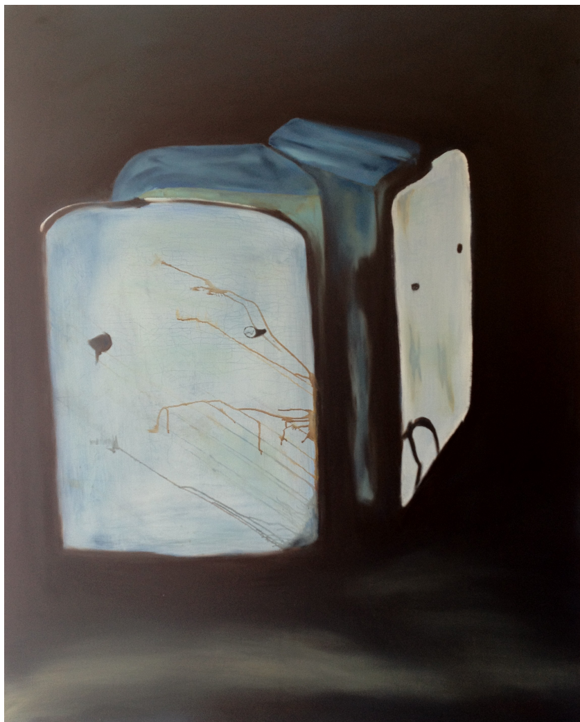
'Grand Union' Oil Painting