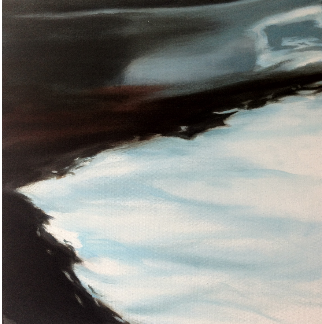
Reflections I' Oil Painting