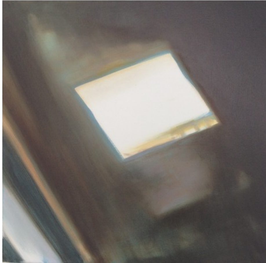
'Skylight' Oil Painting