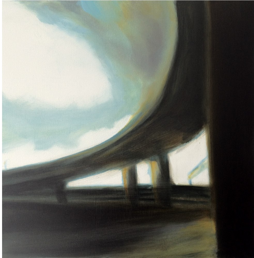
'Under The Bridge V' Oil Painting