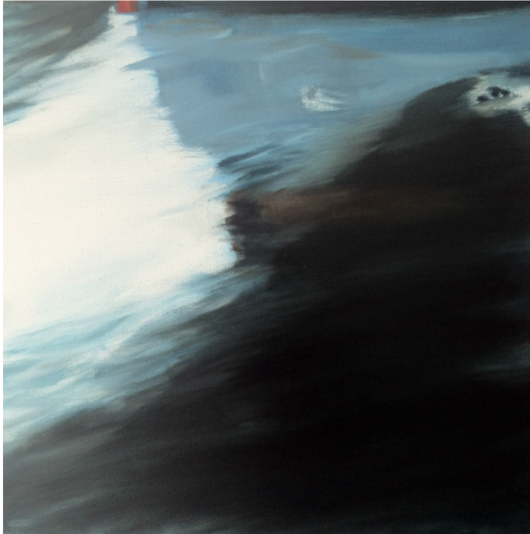
Reflections II' Oil Painting