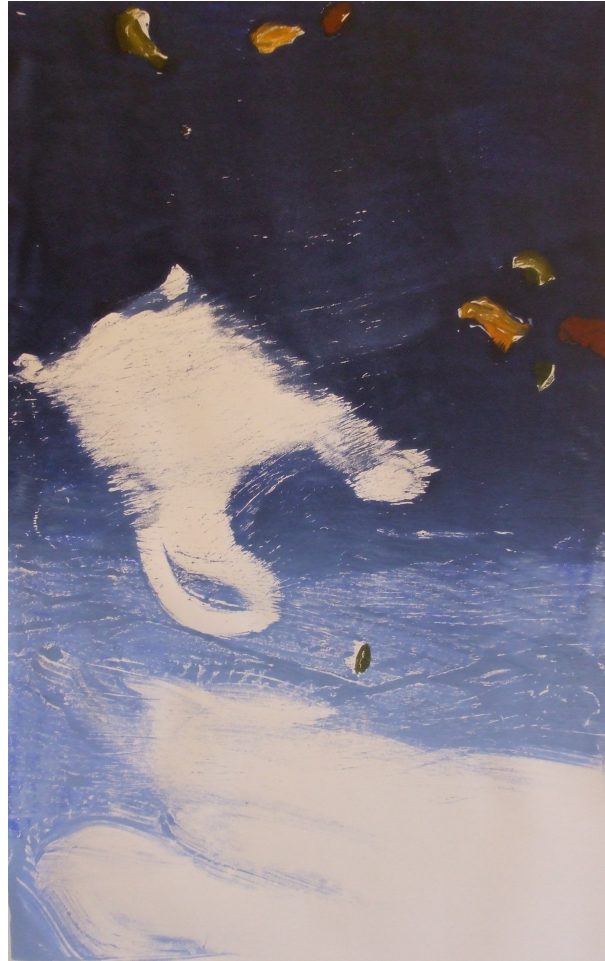
'flotsam II' Print