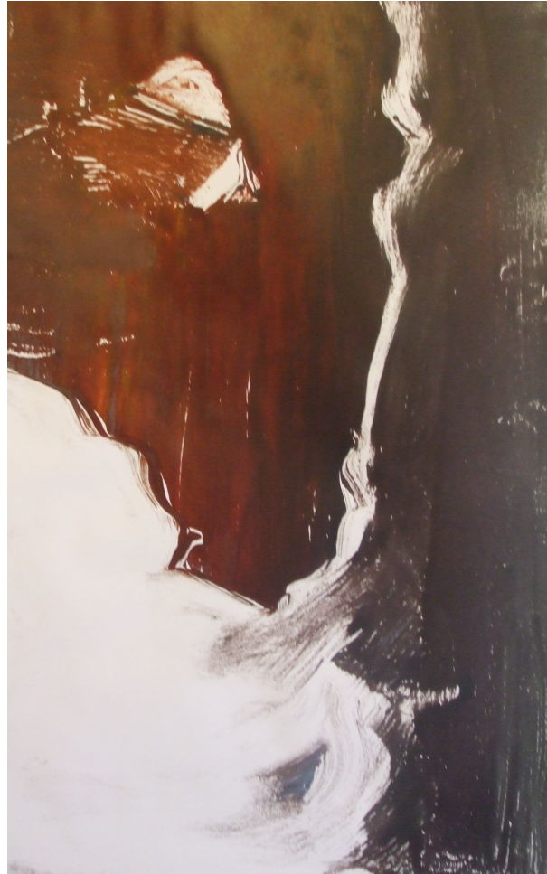
'Flotsam III' Print