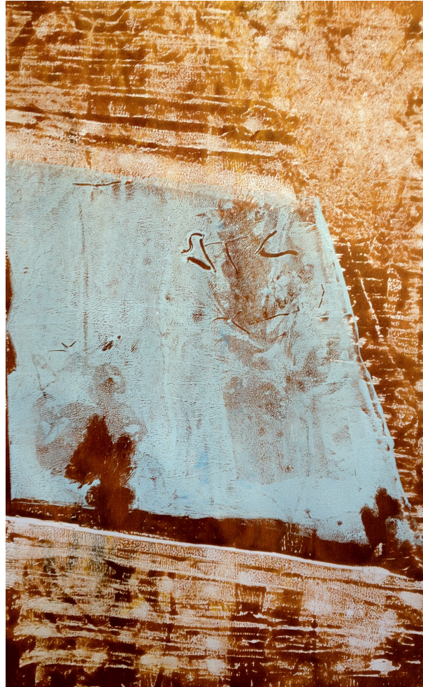
'March 2012 172' Print