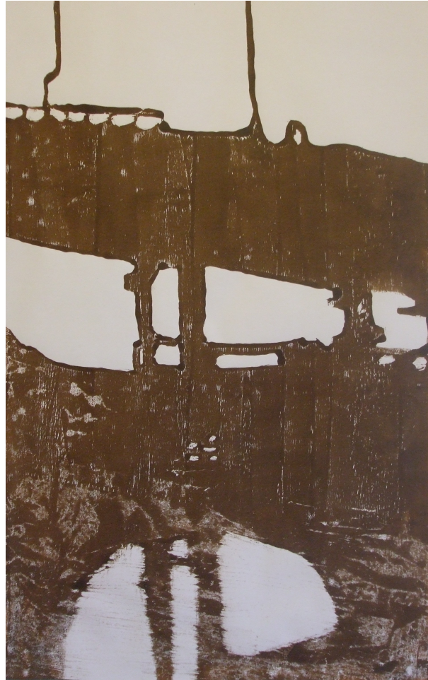
'Negative Spaces I' Print