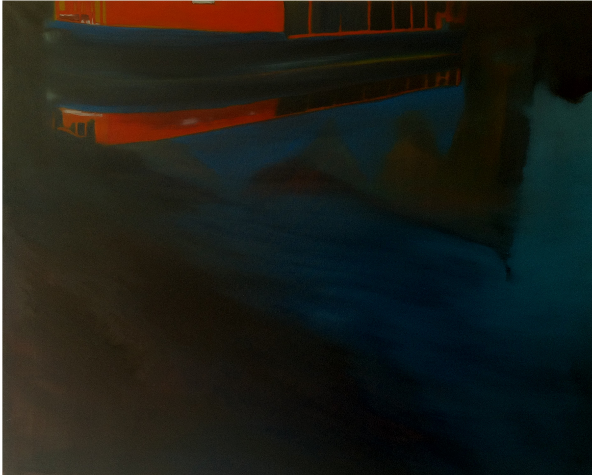
'Slow Boat' Oil Painting