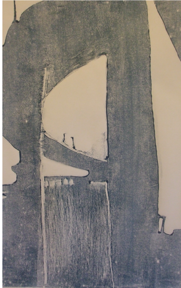
'Negative Spaces II' Print