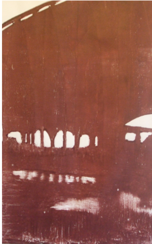
'Negative Spaces III' Print