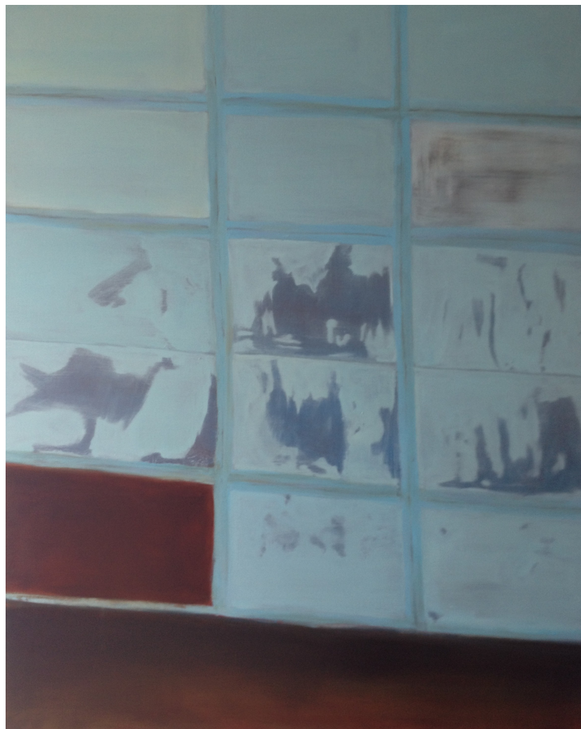
'Panels' Oil Painting