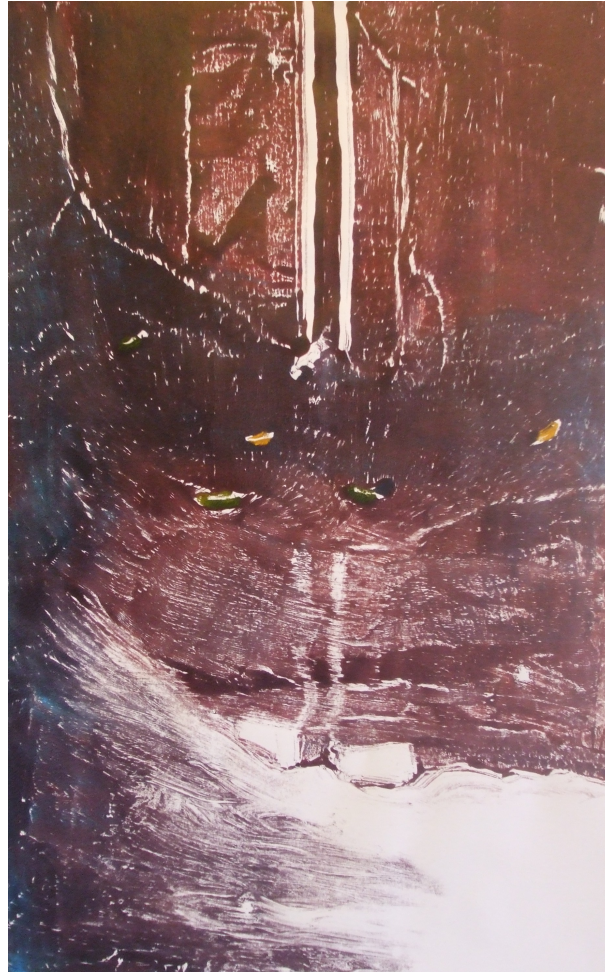
'Flotsam I' Print