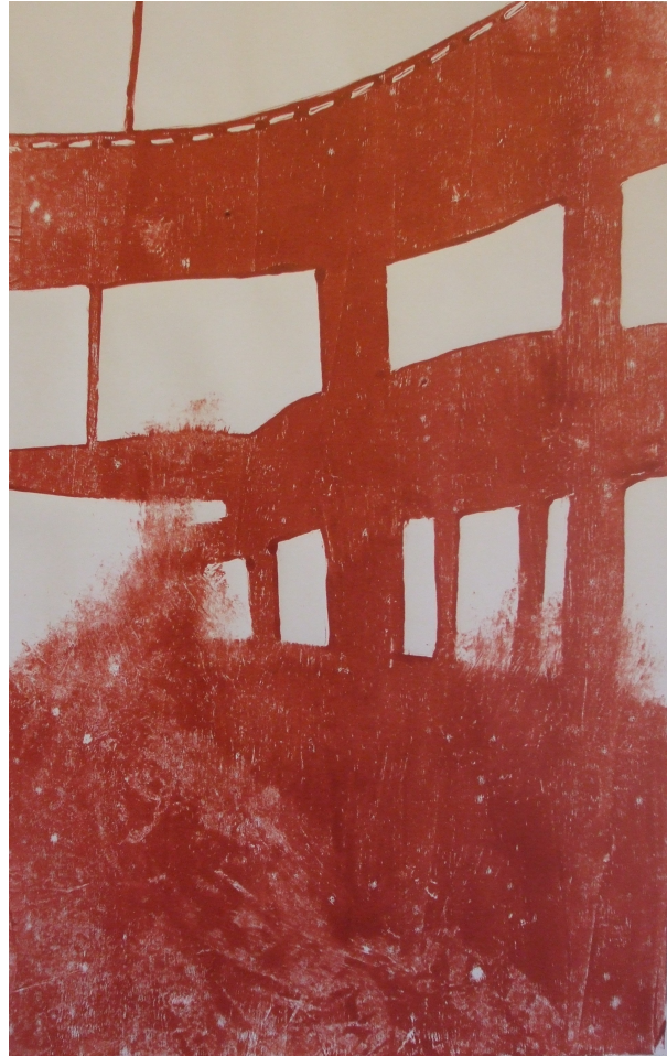
'Negative Spaces IV' Print